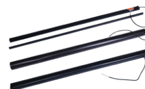
ASO Edge Sensors

SlideSmart CNX and SwingSmart CNX require professional installation