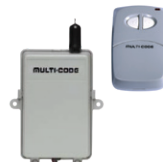
Radio Receivers & Transmitters