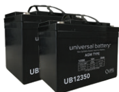
Battery Backup Kit - 35Ah