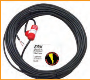
PR-XX (lite preformed loop with lightning protection)